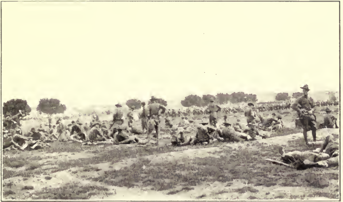
FIVE MINUTES' HALT